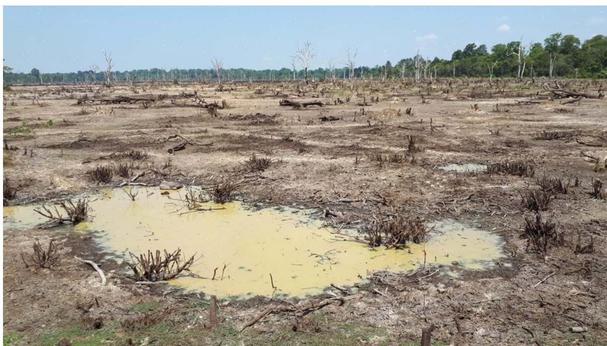
Summer 2019 dry season at Jayatataka Baray lake in Siem Reap, Cambodia.

In 1990, scientists of the Intergovernmental Panel of Climate Change (IPCC) warned that the global mean surface temperature had increased by 0.3 to 0.6 °C over the previous 100 years. The IPCC predicted that global warming would reach 1°C by 2025 and 20 cm of sea-level rise by 2030 (IPCC First Assessment Report , SPM Executive Summary). Thirty years later, the situation is worse than announced.