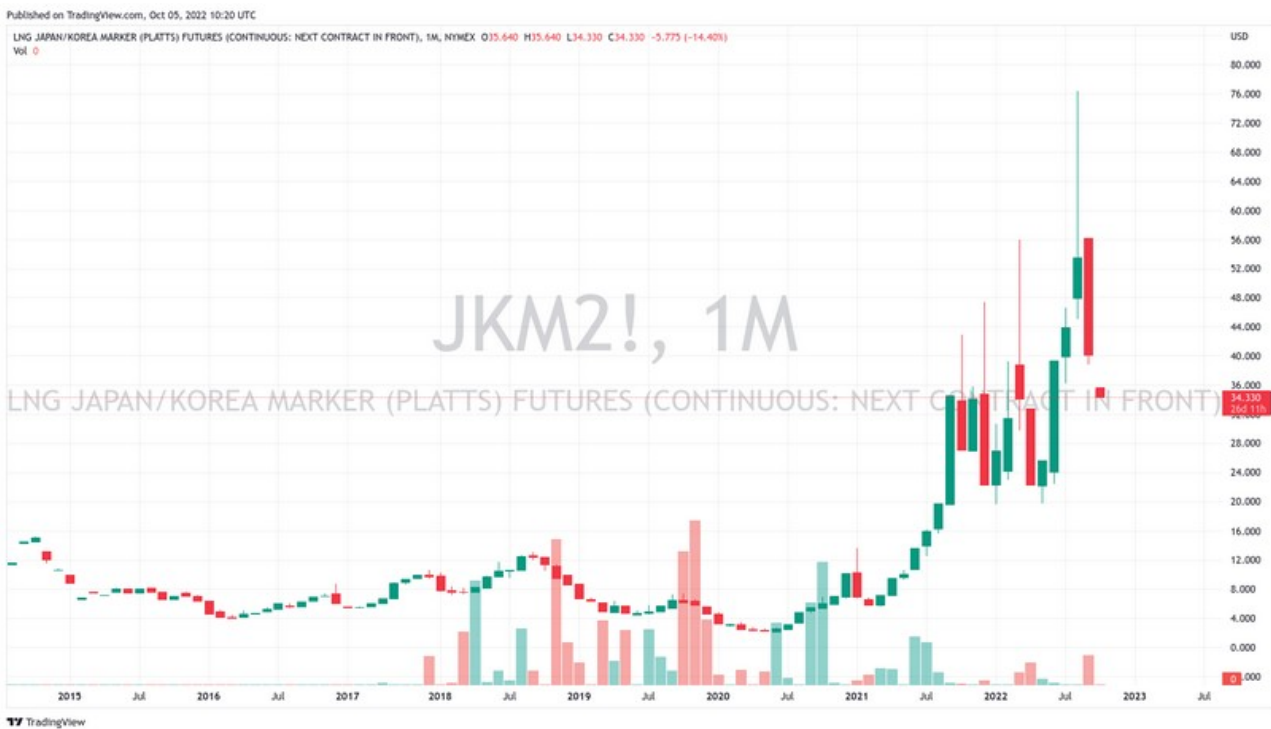
Figure 1: Price of Liquefied Natural Gas in Asia since 2015. The JKM index spiked to over 50 USD/mmBtu in March 2022 and still remains well above its 2015-2020 levels. Source : Tradingviews .